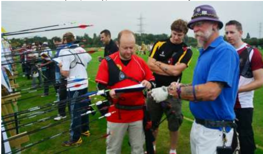
Scoring at the targets