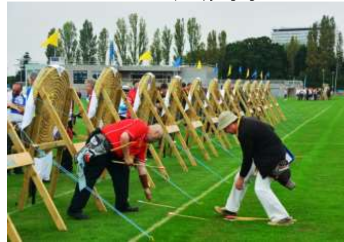
Hunting for missing longbow arrows